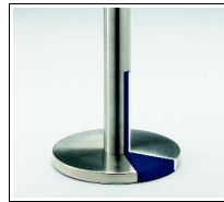
930DM/26/26-96 Satin Stainless Steel w/ Black Belt